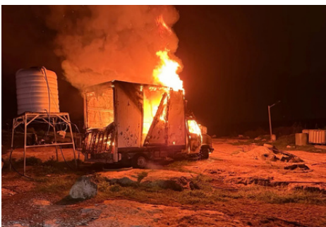
Settlers set fire to Palestinian truck, living tents & a stolen car in Susya.

March, army invaded Palestinian home in Um Durit and cut security camera cables. Settlers pepper sprayed a Palestinian woman.