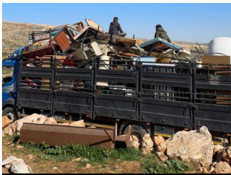
Last families in Al Khalayel displaced due to escalation in settler & army violence.